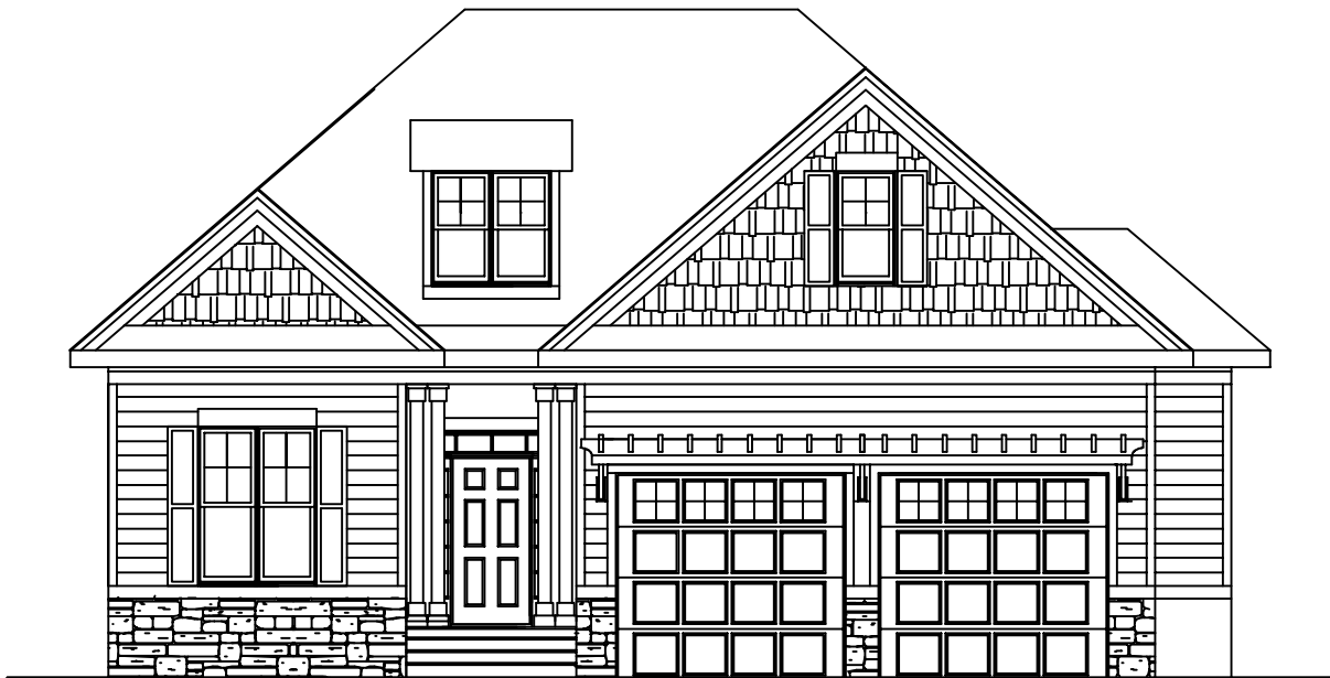
"The Cottage I" Elevation "A"